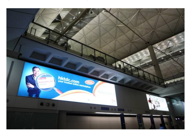
Extra Slim Lightbox at Arrival Hall, HKIA (10500mm x 3000mmH)