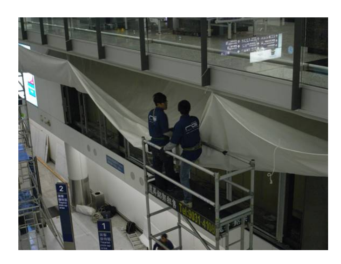
Arrangement of lighting source panel