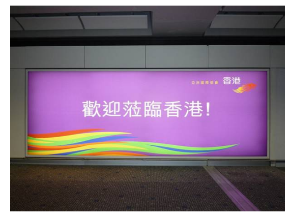
Size: 6000mm x 2200mmH