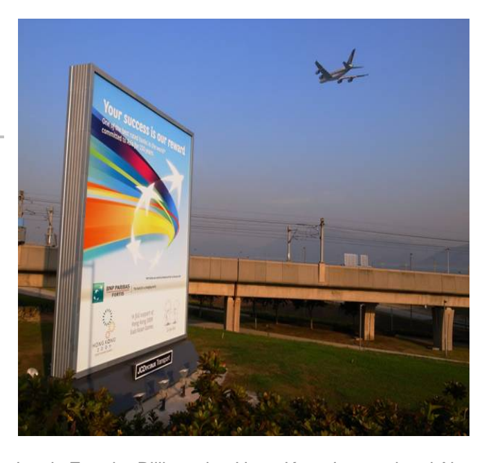
Iconic Exterior Billboard at Hong Kong International Airport