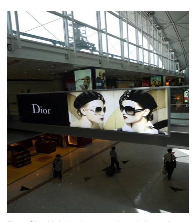
Extra Slim Lightbox hang on glass balustrade (7000mm x 1500mmH)

Slim Lightbox advantages: extra thin, energy saving, high lux level, long life and excellent lighting effect