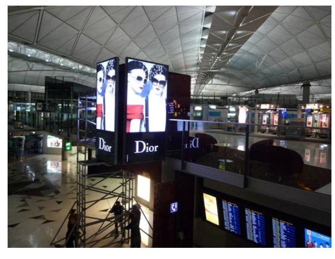
Vertical Extra Slim Lightbox, Departure Hall HKIA (1500mm x 3000mmH)