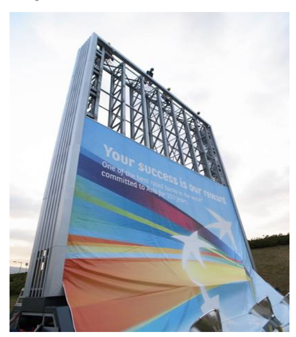
Pull-Up Installation Method

This iconic billboard is featured with contemporary architectural sense, large display area, simple but safe modular structure and a mechanic pulling system for easy banner installation.