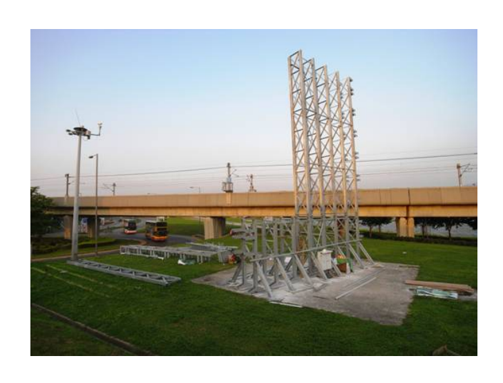
On Site Installation of Modular Structure