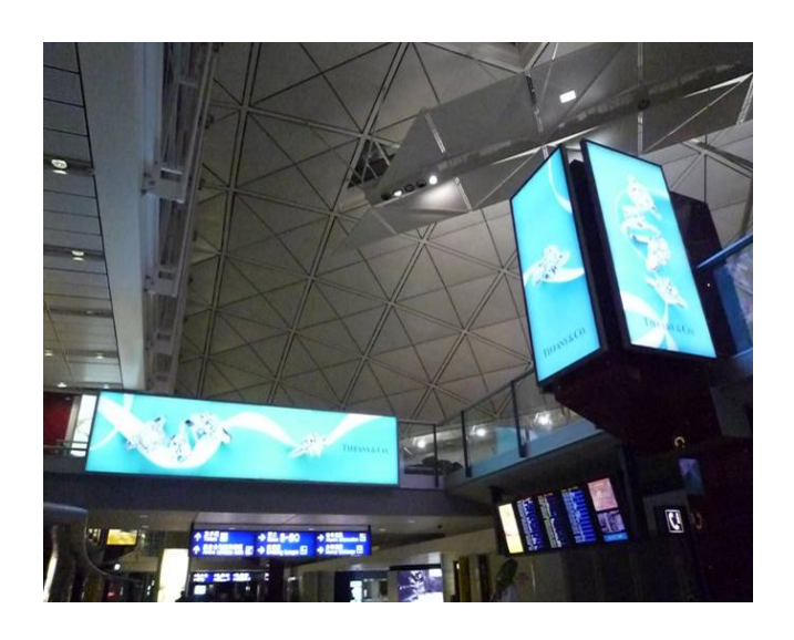
Vertical and Horizontal Extra Slim Lightbox