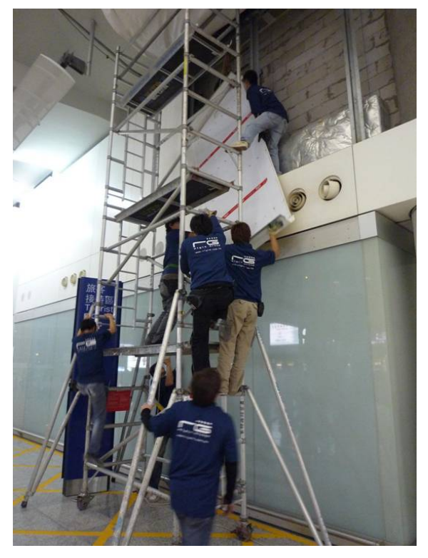
Extra Slim Lightbox at Arrival Hall, HKIA

Rigid Lighting solution for different lightbox sizes.